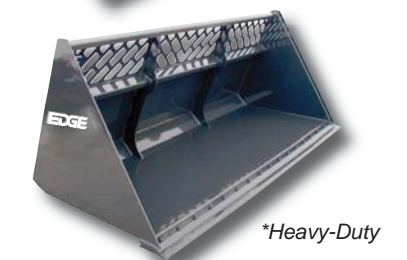
*Medium-Duty and Heavy-Duty buckets are shown with optional bolt-on cutting edge